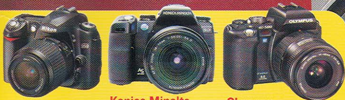
Nikon D50 p.74